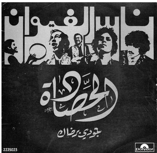
Album TK, Year TK